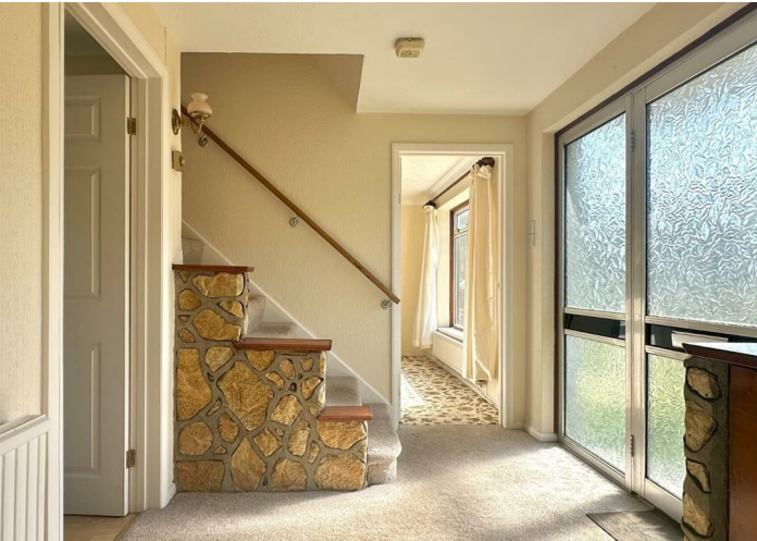
Front door into hallway.

Central hallway, doors to ground floor rooms, stairs to first floor. Window to front, carpet, radiator and meter cupboard.